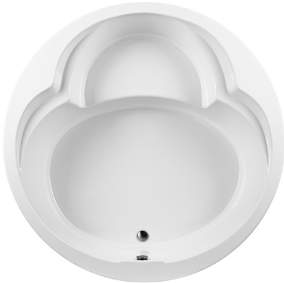
Features an integral seat.