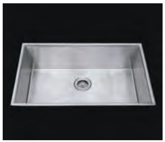
*Flush-Mount Installation Kit is included with each sink *Custom ADA compliant versions are available