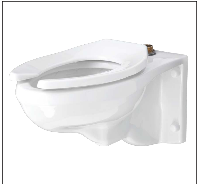
Seat not included